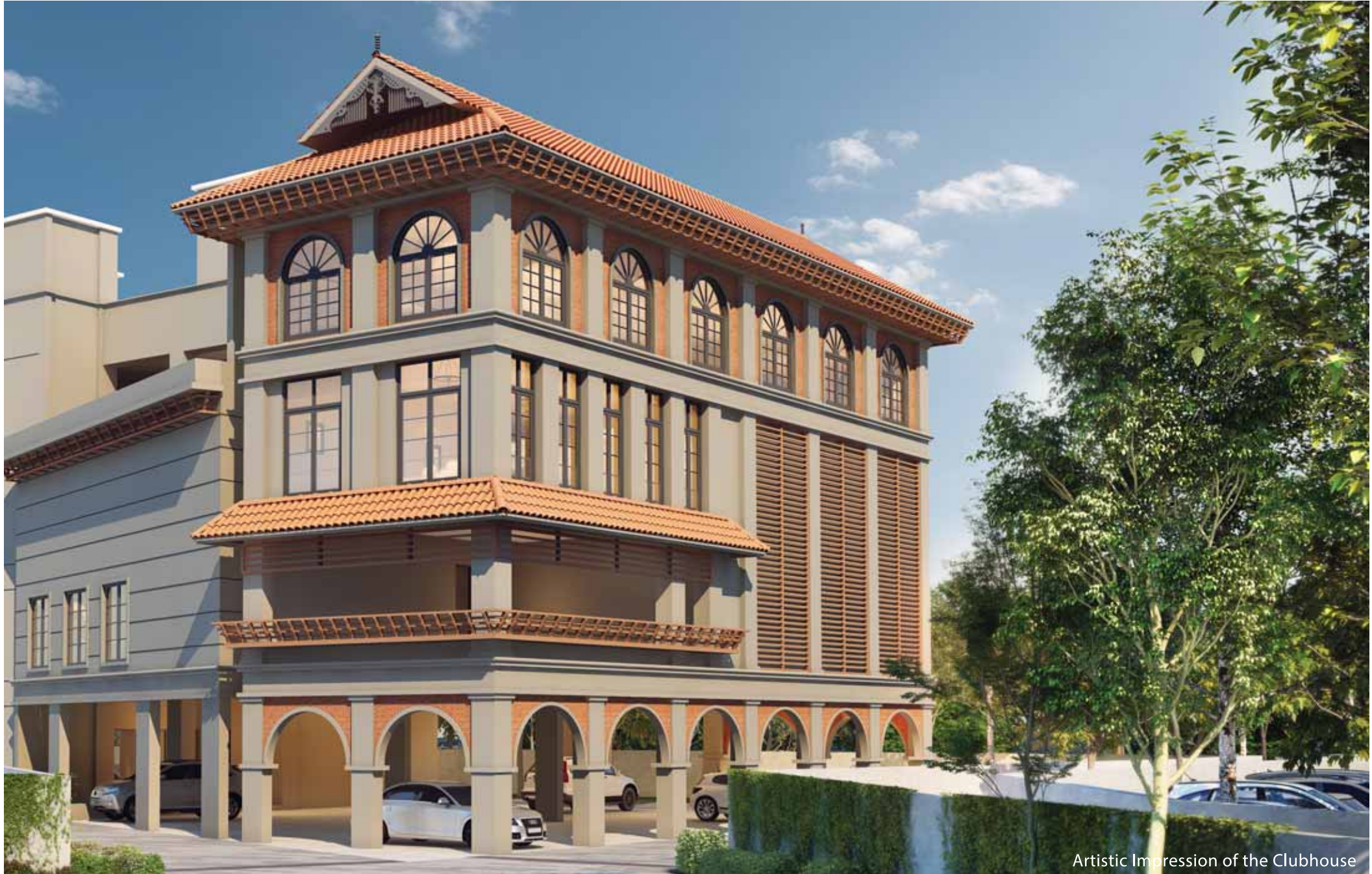
Artistic Impression of the Clubhouse