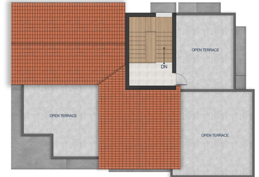
TERRACE LAYOUT - TYPE A- 4 BEDROOMS