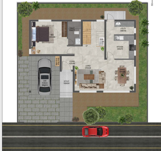
GROUND FLOOR PLAN - TYPE A'- 4 BEDROOMS