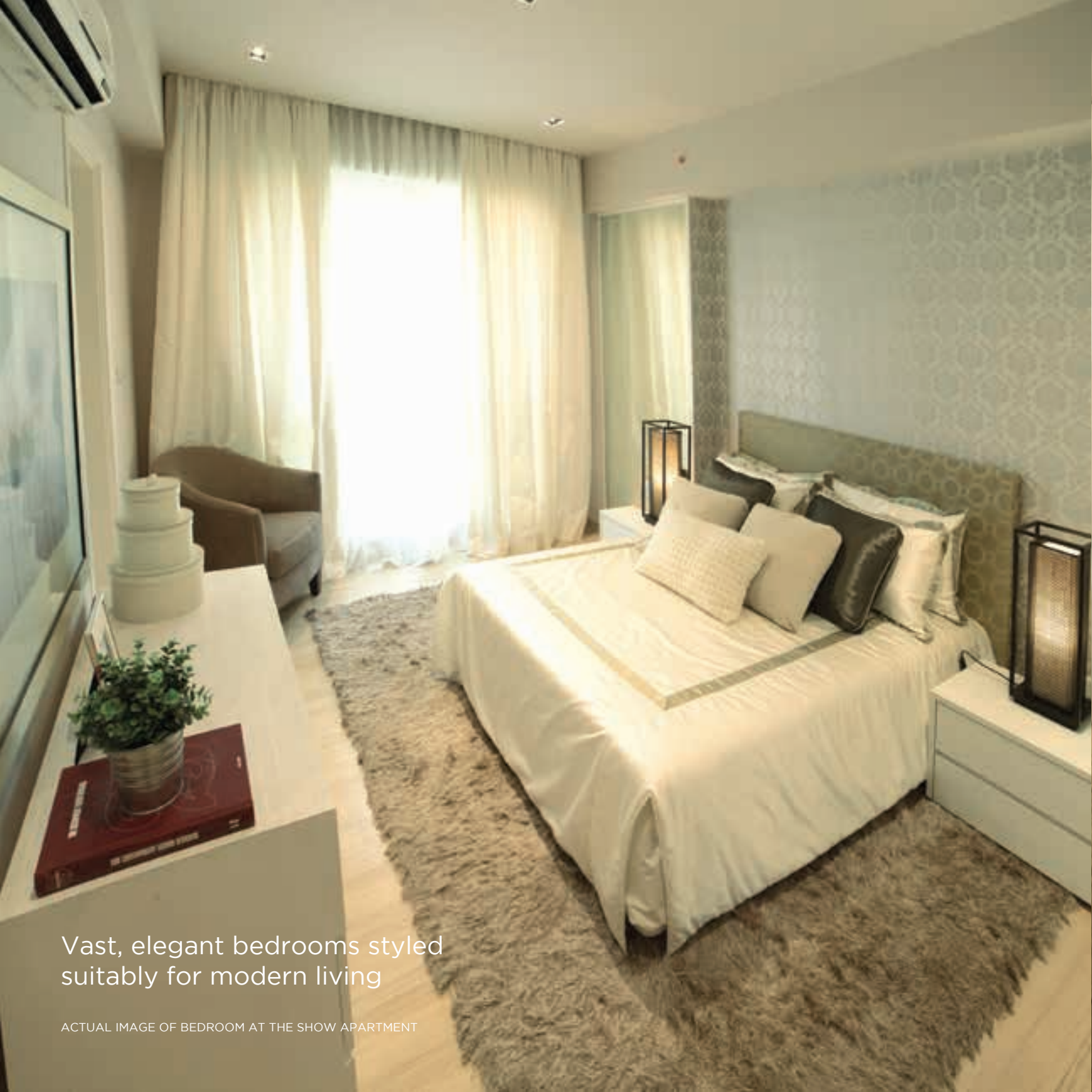
Vast, elegant bedrooms styled suitably for modern living

ACTUAL IMAGE OF BEDROOM AT THE SHOW APARTMENT