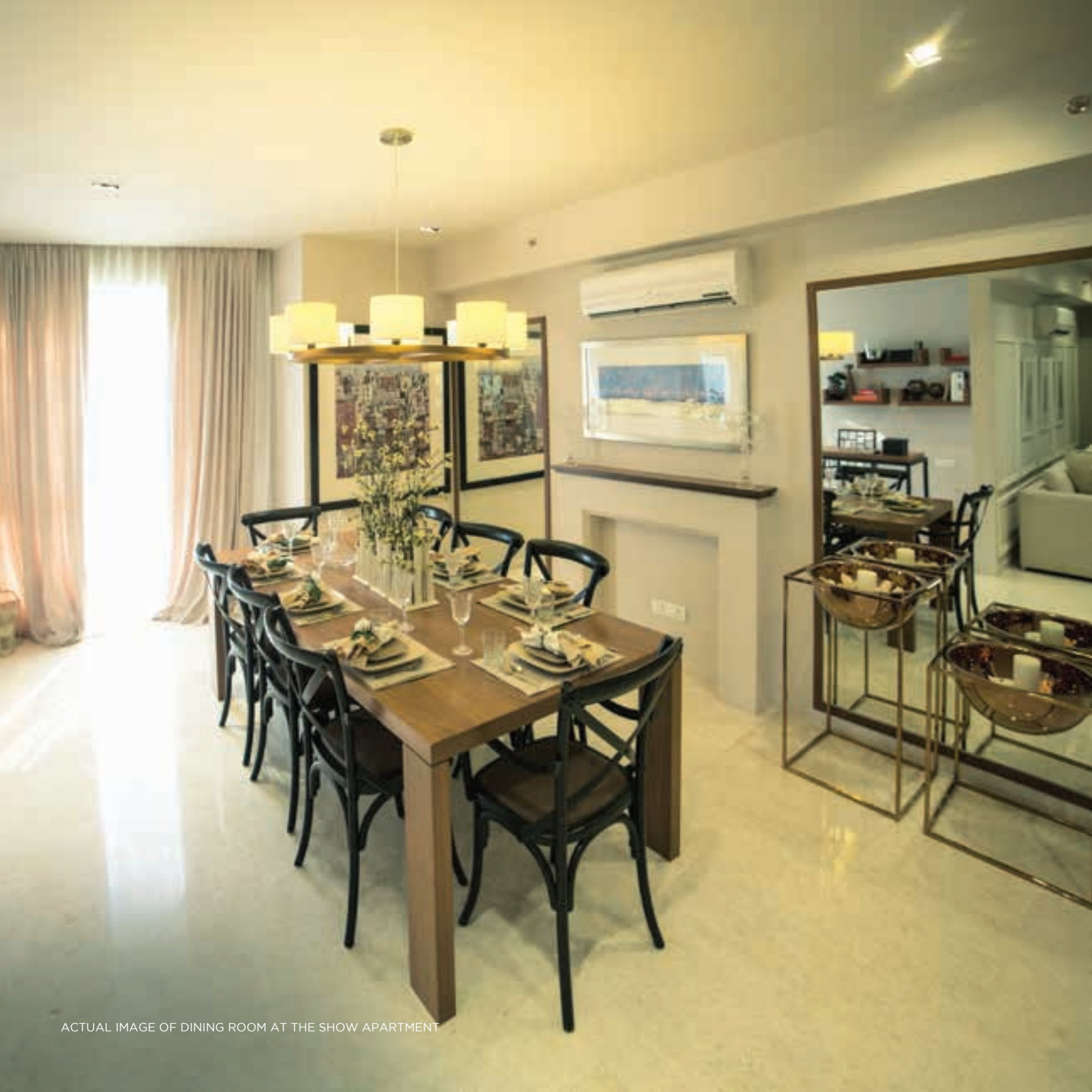
ACTUAL IMAGE OF DINING ROOM AT THE SHOW APARTMENT