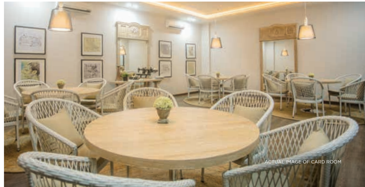
ACTUAL IMAGE OF CARD ROOM