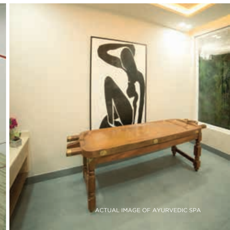
ACTUAL IMAGE OF AYURVEDIC SPA