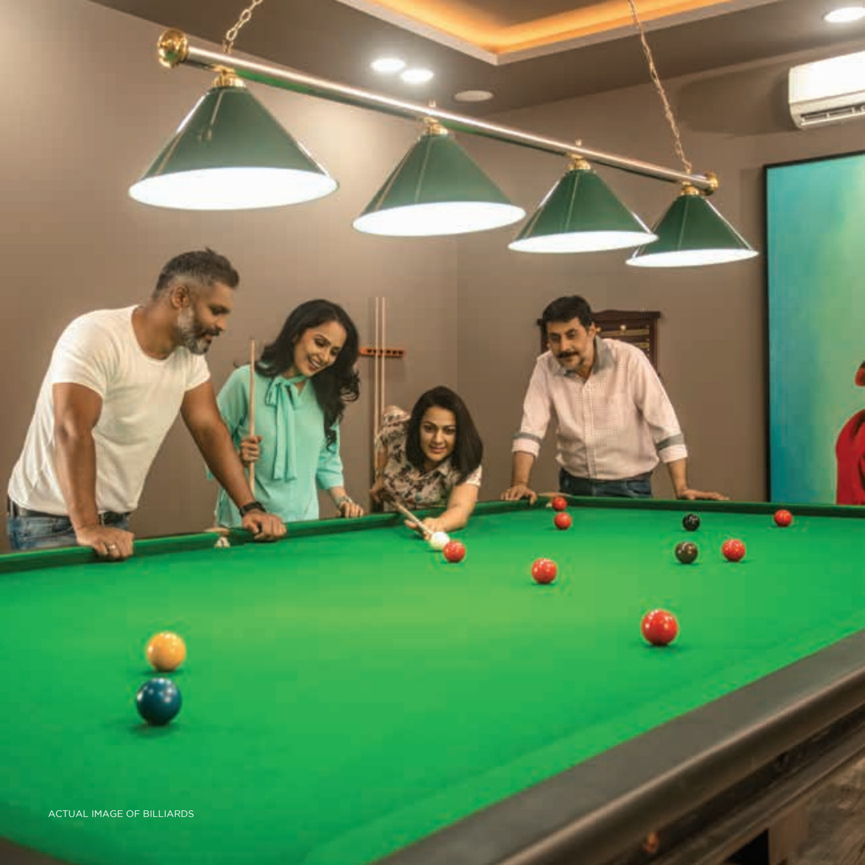
ACTUAL IMAGE OF BILLIARDS