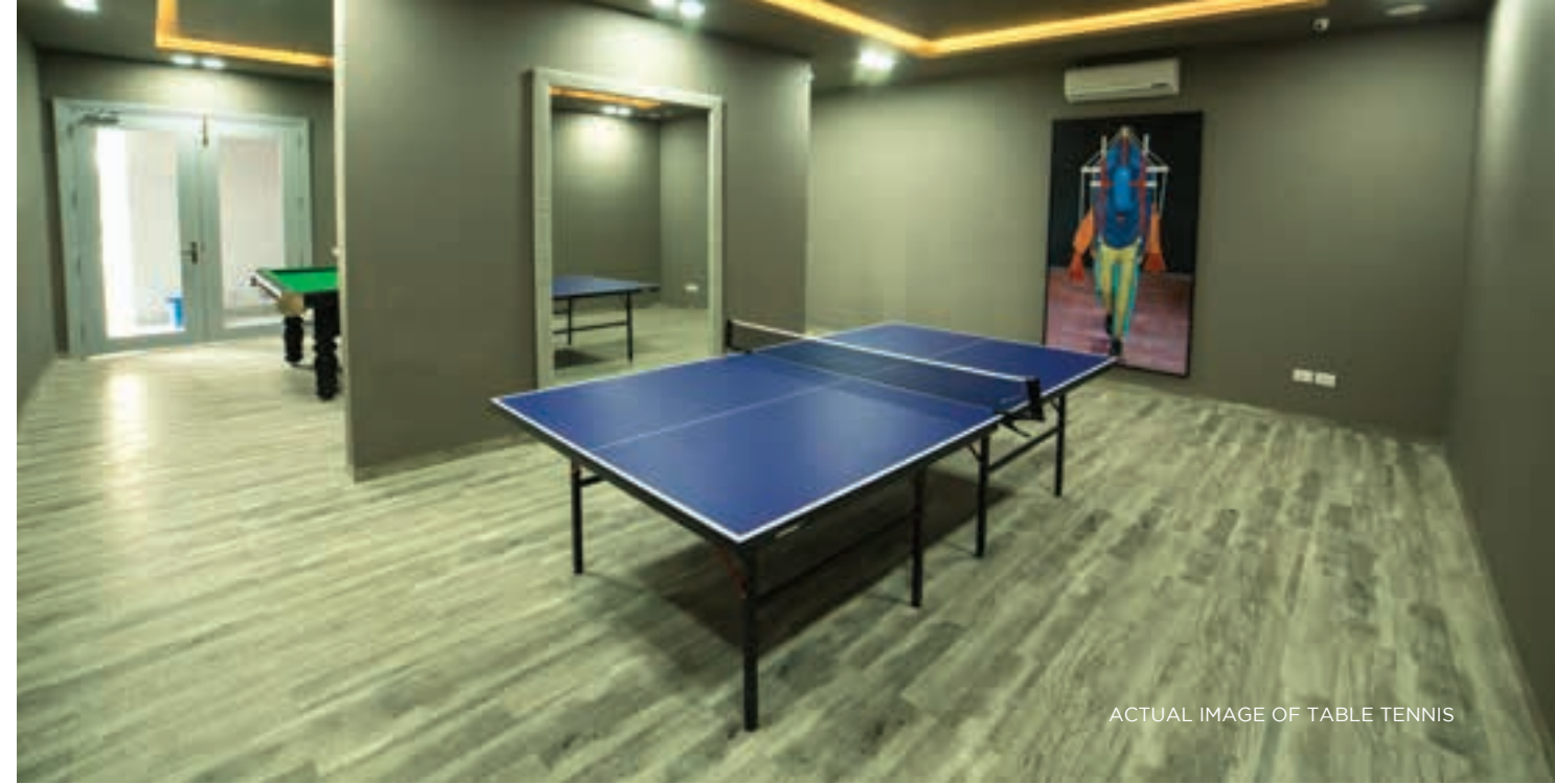
ACTUAL IMAGE OF TABLE TENNIS