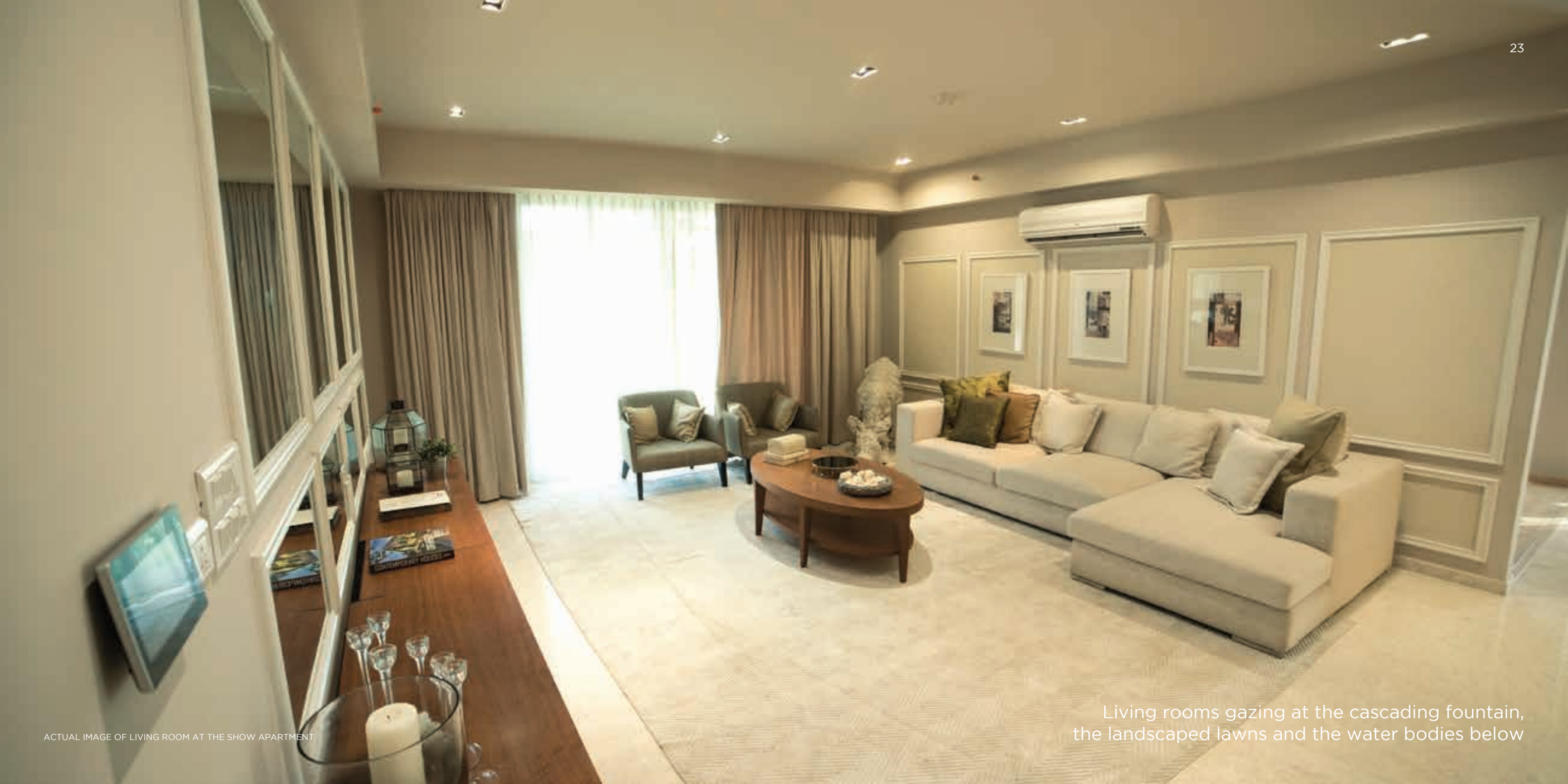
ACTUAL IMAGE OF LIVING ROOM AT THE SHOW APARTMENT