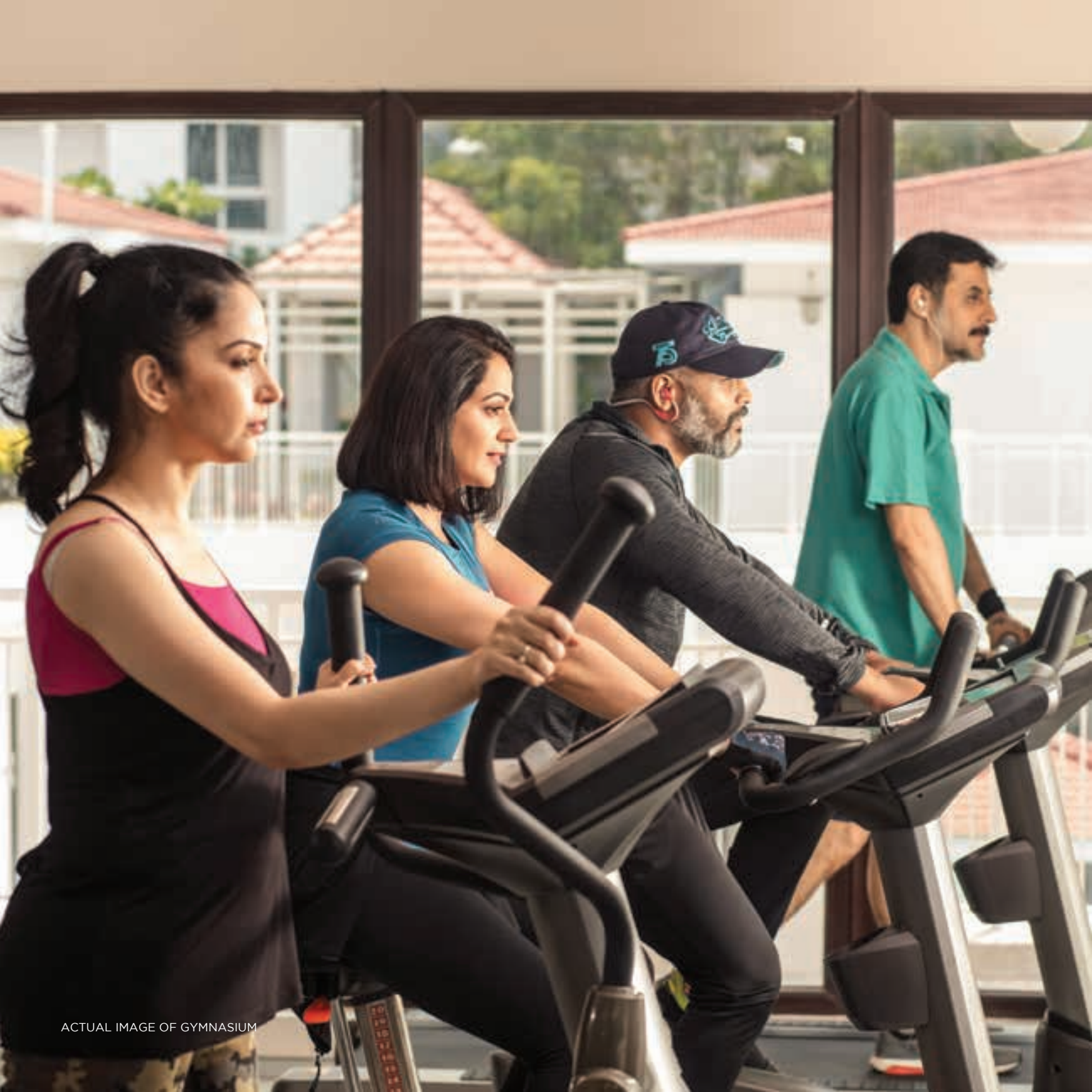
ACTUAL IMAGE OF GYMNASIUM