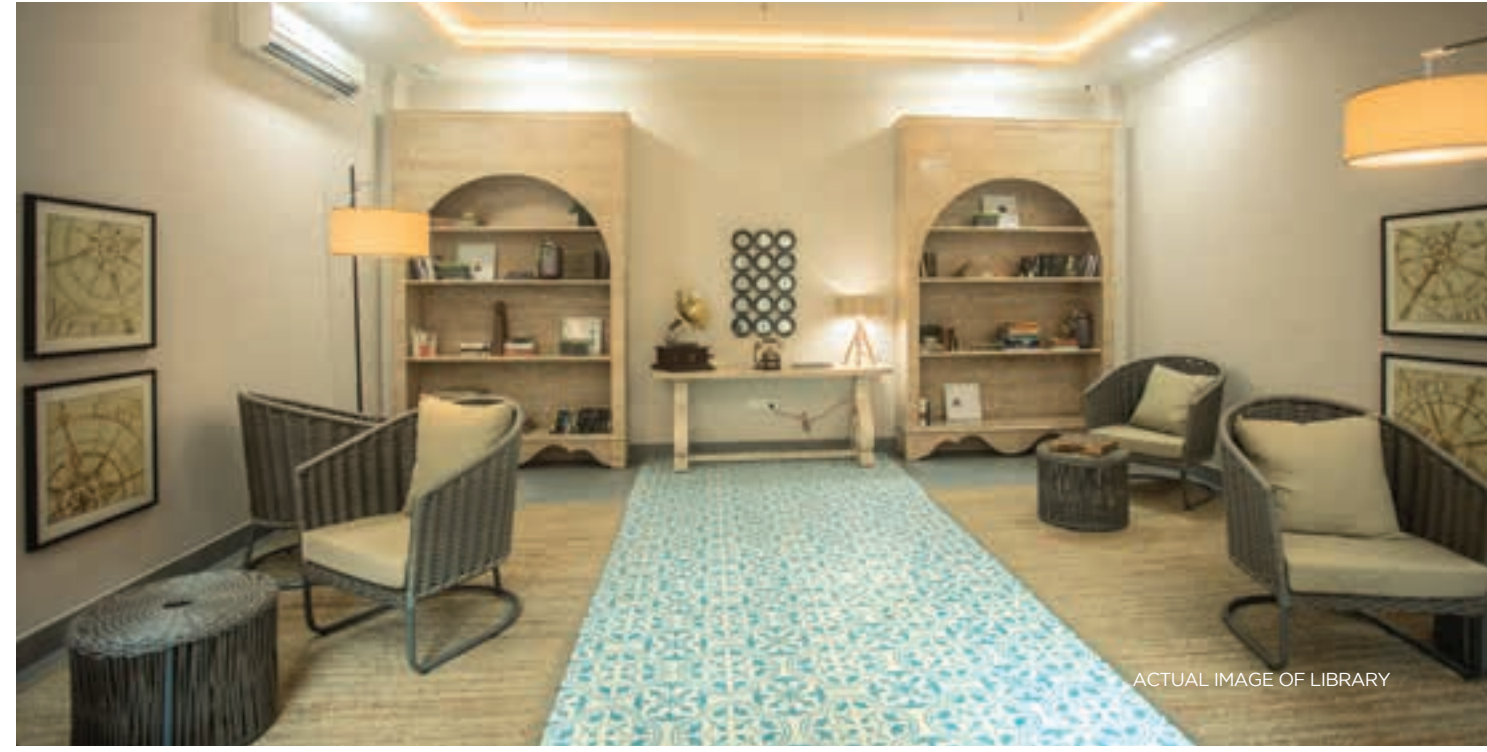
ACTUAL IMAGE OF LIBRARY