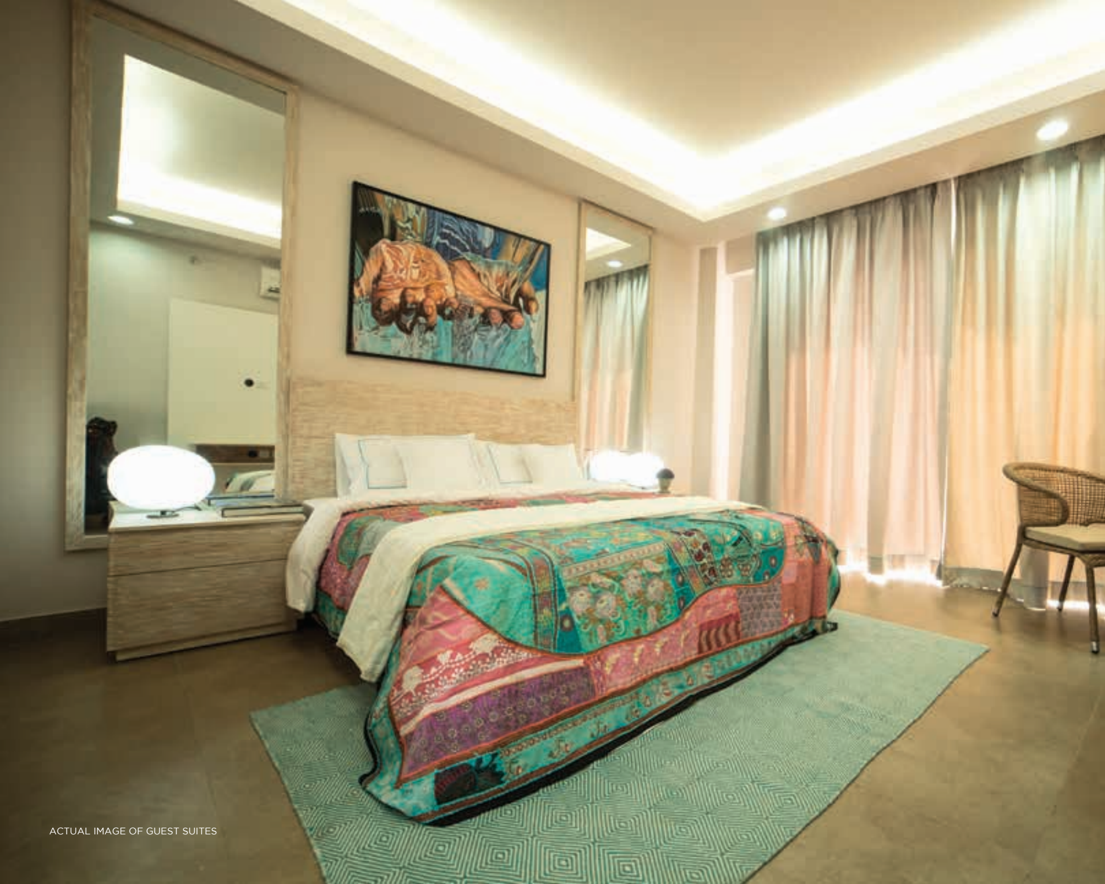
ACTUAL IMAGE OF GUEST SUITES