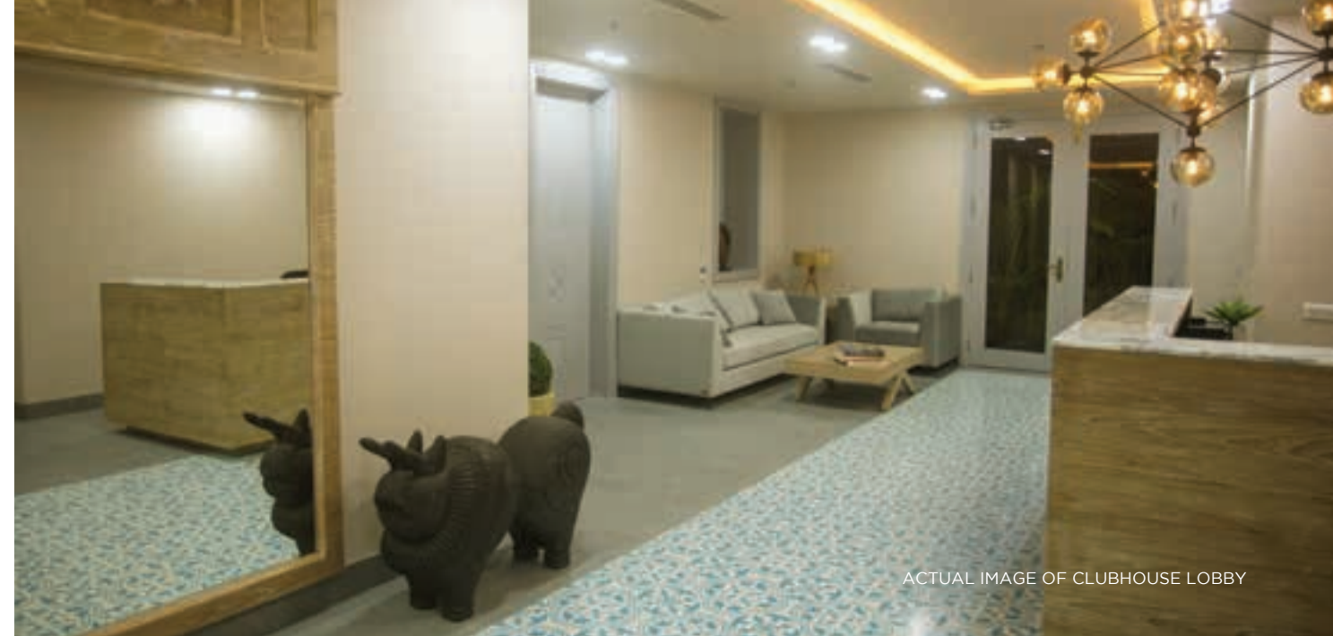
ACTUAL IMAGE OF CLUBHOUSE LOBBY