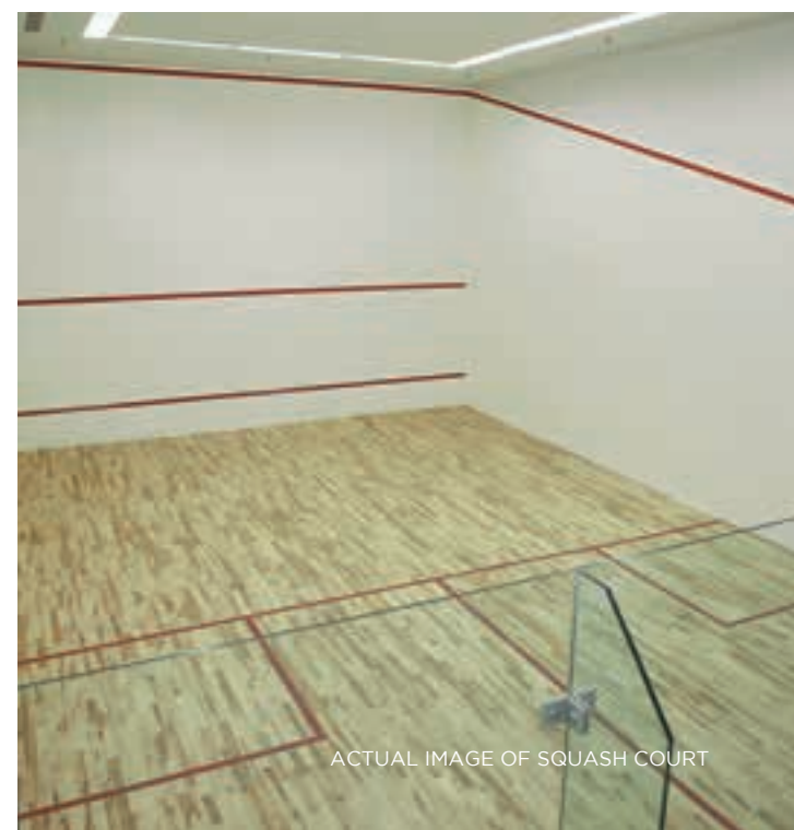
ACTUAL IMAGE OF SQUASH COURT