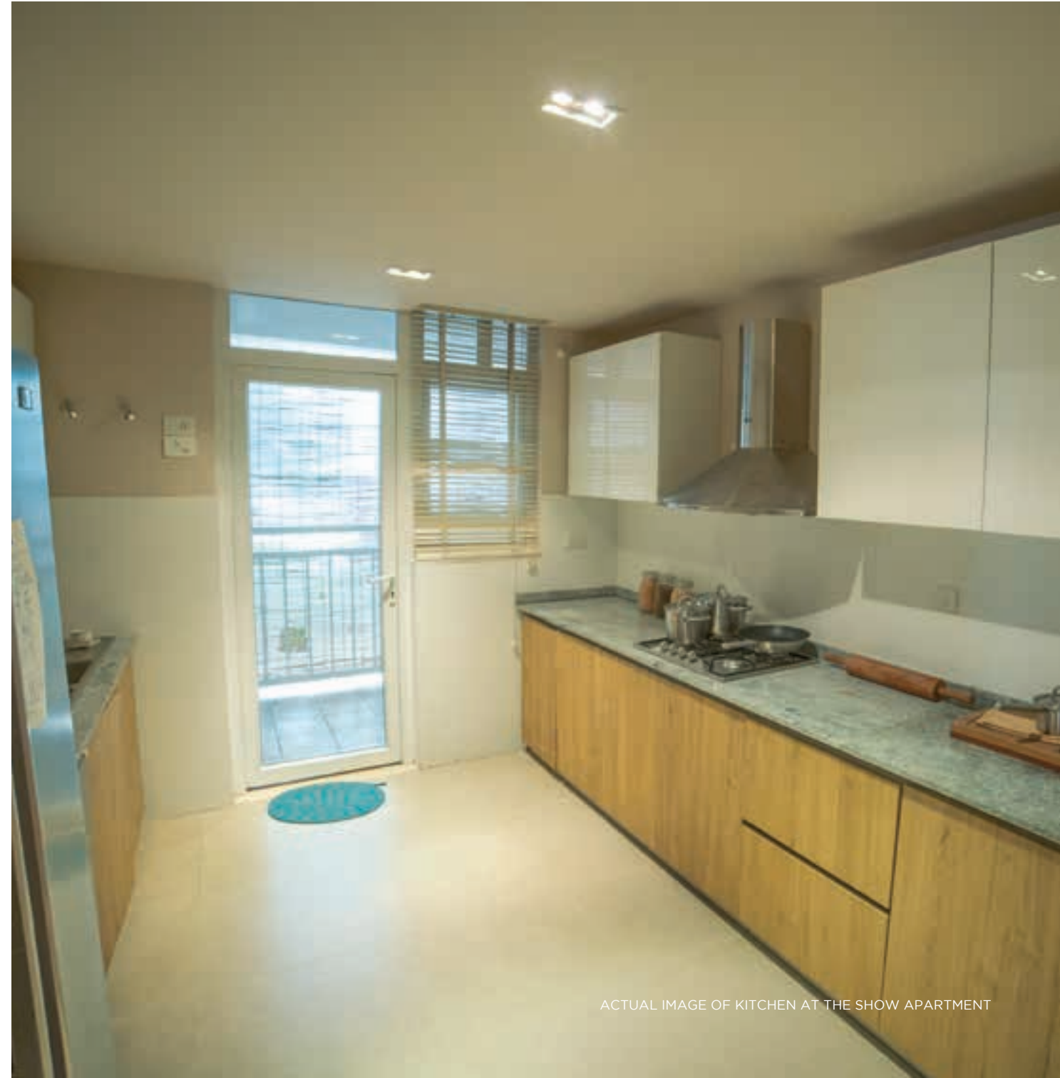
ACTUAL IMAGE OF KITCHEN AT THE SHOW APARTMENT