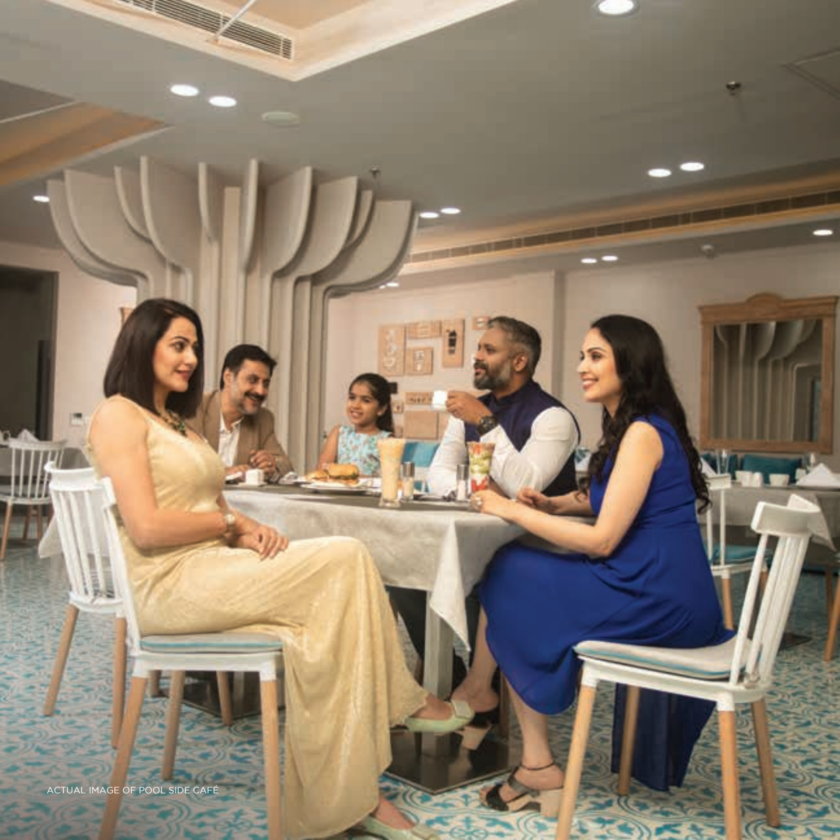
ACTUAL IMAGE OF POOL SIDE CAFÉ